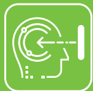
Proactive Facial Recognition