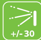
Wide Pose Angle Acceptance