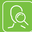
Touchless for Better Hygiene