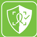
New Height of Anti-Spoofing